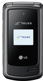
Any TELUS compatible phone