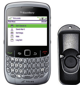
Any TELUS compatible BlackBerry® & Alert Pendant