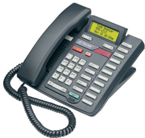
Any Voice Enabled Phone