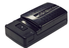
Dedicated Standalone Device